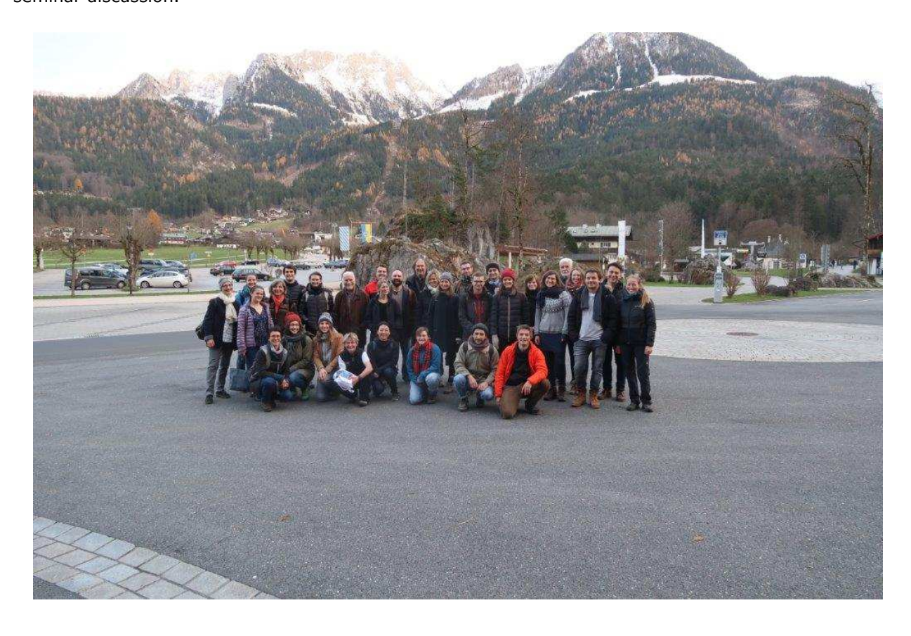
The RCC group at the entrance to the Nationalpark Berchtesgaden.