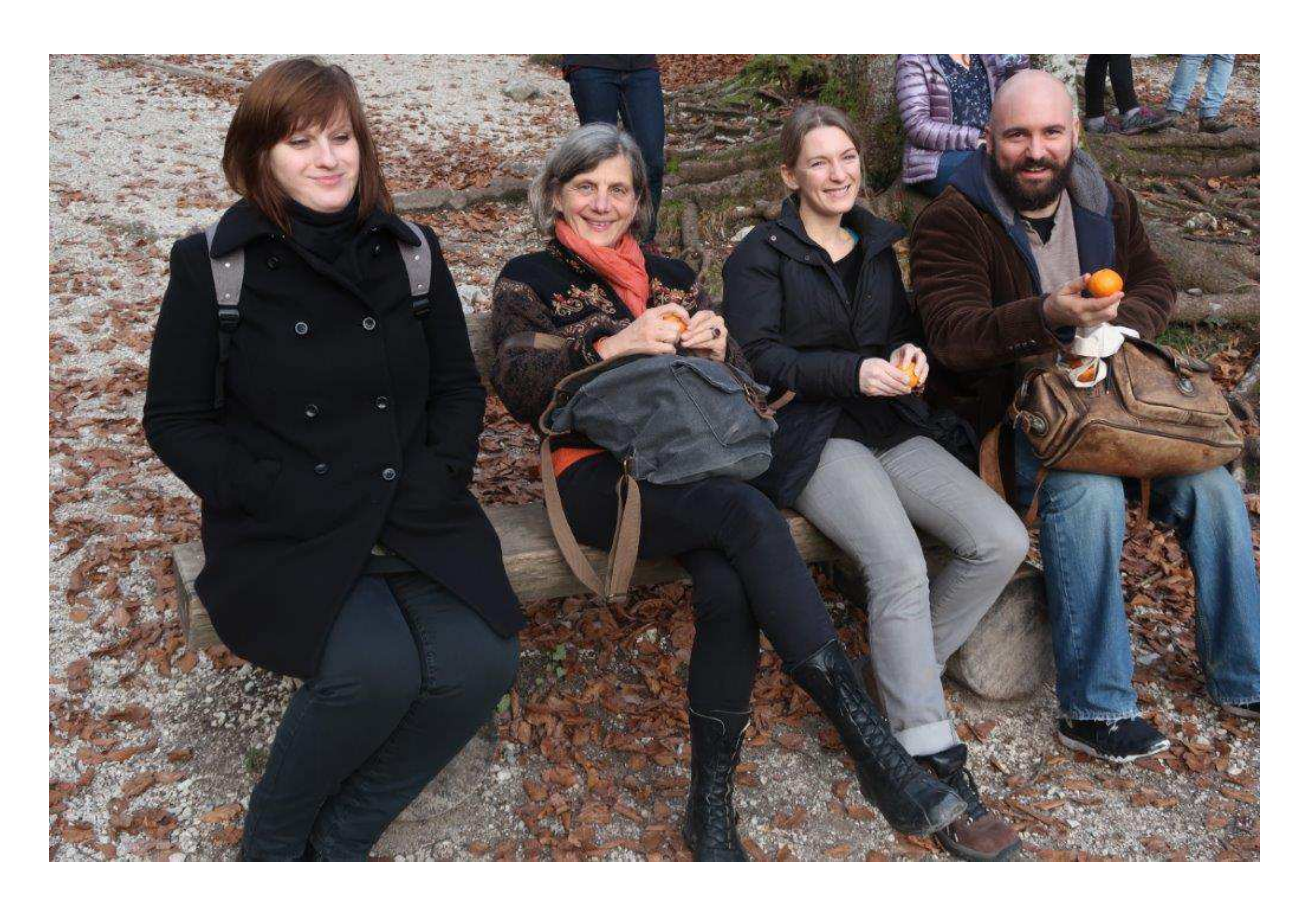
RCC fellows taking a break during the hike through the Nationalpark.